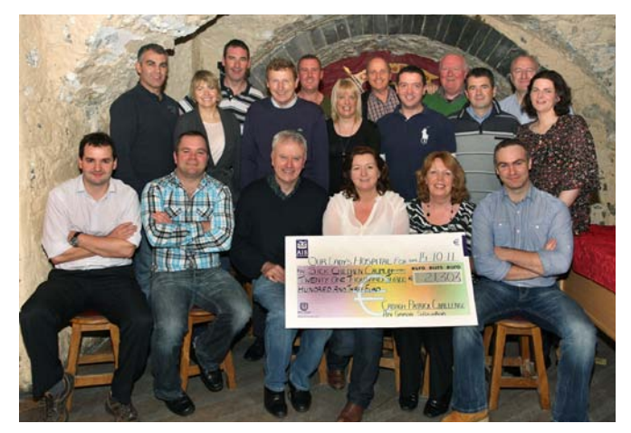
Participants in the charity cycle/climb raised over €20,000 for Crumlin Children's Hospital Dublin.

Community Policing Units in the Galway Division had a busy 2011, highlights of which included an Open Day at the Garda Ballybane Community Office , the establishment of a new Neighbourhood Watch Scheme in the Maunsell's Road Area, and the hosting of a local Polish School at Ballinasloe Garda Station during Social Inclusion Week. In May 2011, Gardaí based in Salthill organised a Charity Cycle/Climb , the