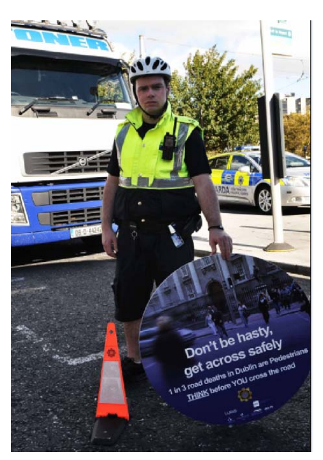
The launch of the 'Don't be hasty' campaign at Heuston Station, Dublin in September 2011, which aimed to raise awareness of road safety among pedestrians.

2011 stands at 171, this is 11 less than in 2010. The number of fatal collisions has decreased year on year since 2005.