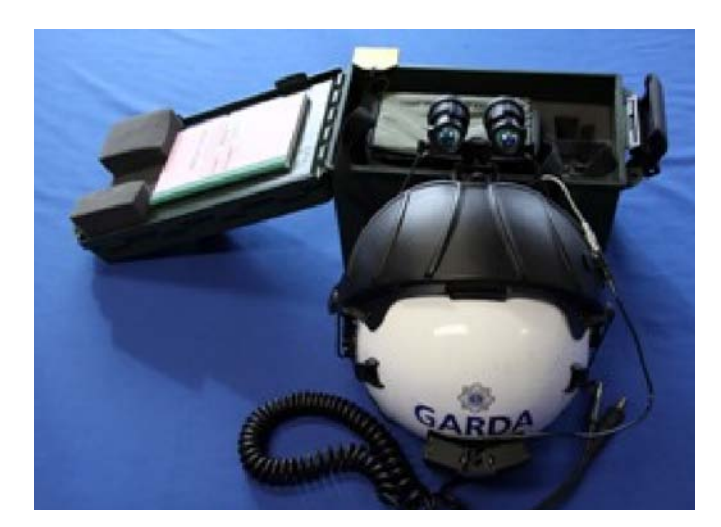
The new Night Vision Goggles make night time flights possible.

On 7 July 2011, the Garda helicopter responded to a call for assistance from Portumna Gardaí regarding incidents of aggravated burglary, burglary and robbery. A number of suspects had fled from investigating Gardaí into an area of forestry and open country. The helicopter conducted a thermal image search of the area and the crew detected a faint thermal heat signature from one of the suspects, who had